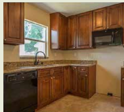
Florida Minority Community Reinvestment Coalition

Over time, Pina has learned how to reduce the costs associated with renovating and building homes, such as buying construction materials like tile and granite in bulk. With flexible capital raised from banks, he can purchase the materials and avoid upcharges typically requested by a contractor. These savings allow