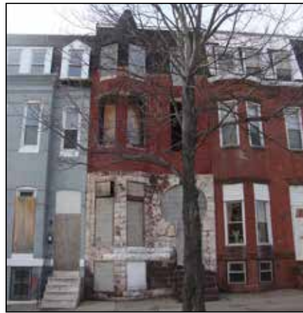
Before: The deteriorating façade of this brownstone in Baltimore is typical of the need for rehabilitation of homes in the city's historic Oliver neighborhood.

The Reinvestment Fund and BUILD formed a partnership, TRF DP, to implement the East Baltimore plan, working with the city of Baltimore, Johns Hopkins University, and several of the city's leading foundations. The Reinvestment Fund's policy solutions team