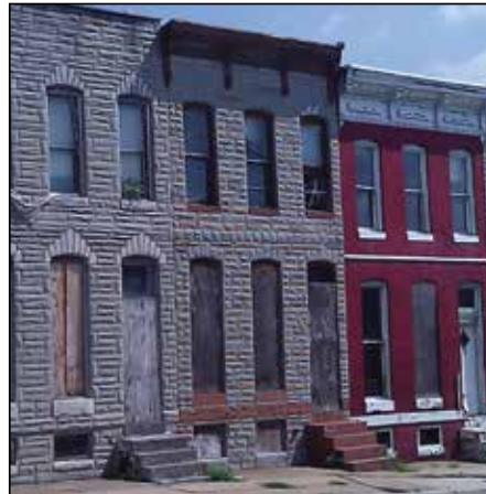
Before: Abandoned row houses in the historic Oliver neighborhood of East Baltimore. After: The block of row houses is transformed, contributing to the revitalization of the neighborhood.

Affordable housing is a core component of community development under the CRA regulations. Banks may receive CRA consideration for loans, qualified investments, and community development services with a primary purpose of revitalizing or stabilizing