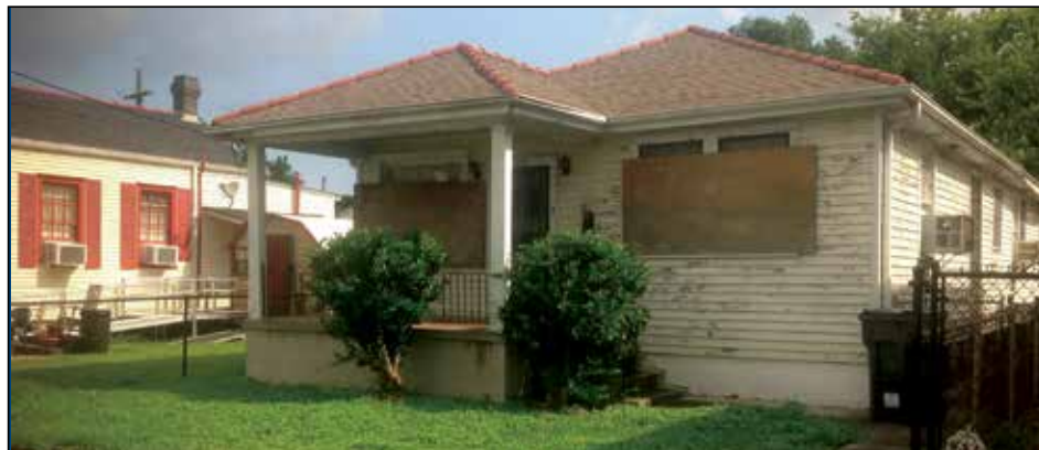
Before: A distressed bungalow before it was rehabilitated by Redmellon Restoration & Development, a real estate development company in New Orleans.

Changing demographics and market forces are driving up overall demand for rehabilitation financing, which totaled $220 billion in 2015. 1 Today's housing rehabilitation trends are fueled by strong sales of existing homes, which continue to